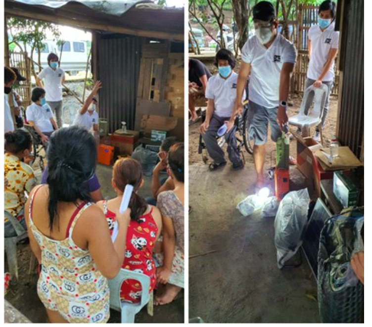
Energy Exchange activities

The group believes in building a relationship with each community, an objective that also helps them design an approach to provide better support and improve their program. Feeding programs, livelihood training, and school activities are also organized while also raising funds for solar lamps that will be given to households without electricity access.